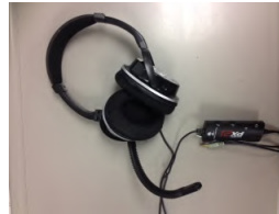
Turtle Beach Headset used as a microphone

Screencasting is a whole lot easier than you would think! I can almost guarantee you may already have all the equipment necessary in your classroom or at your school.